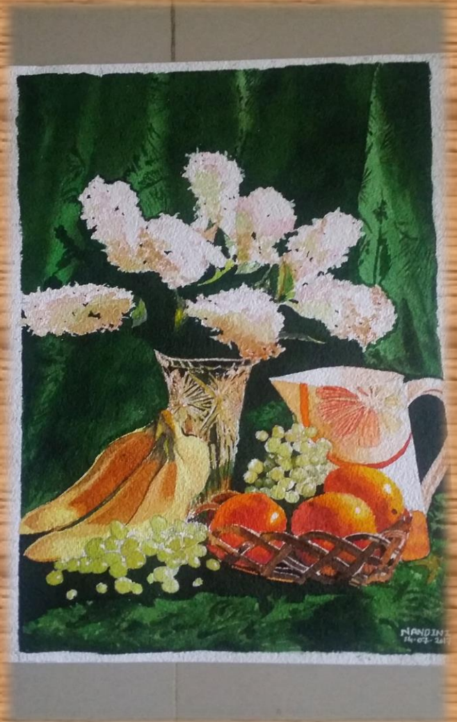
- Prathamesh S.Chandane (SYME)